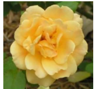
EASY GOING ROSE AN EARTHKIND ROSE AT THE DALLAS ARBORETUM

Texas Garden Clubs invites you to read and enjoy the Lone Star Gardener online. Click on www.texasgardenclubs.org to go to the TGC home page. Click the white flower in the box on the right side of the home page to read the LSG online.