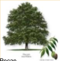
Pecan carya no nens s

Visit their 4 acres of Demonstration Gardens on Saturday, November 3, 2012, and talk to the volunteers who design and maintain them. It's a great way to learn! Park in front of the Agriculture Center located at 1402 Band Road, Rosenberg. Take one of the sidewalks back to the area behind the building to find the Master Gardeners. Gardens are open from 9:00-11:00 a.m.